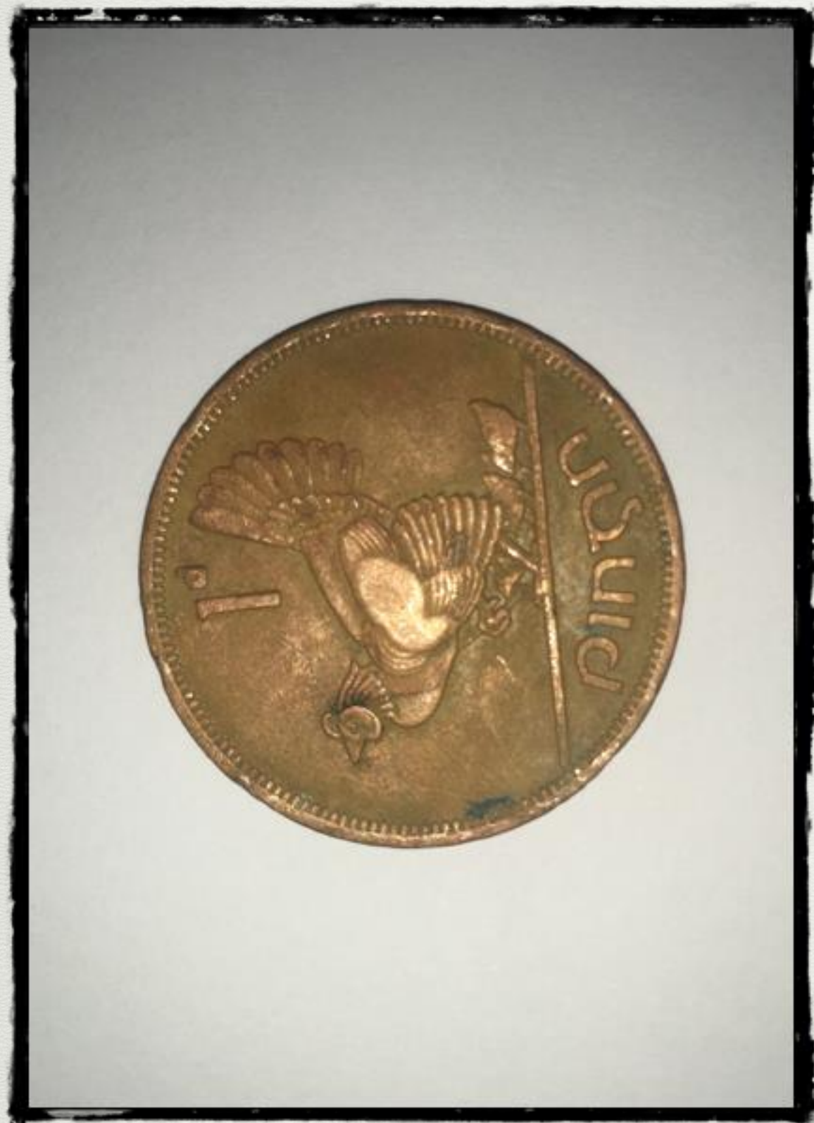
Old Penny Coin.