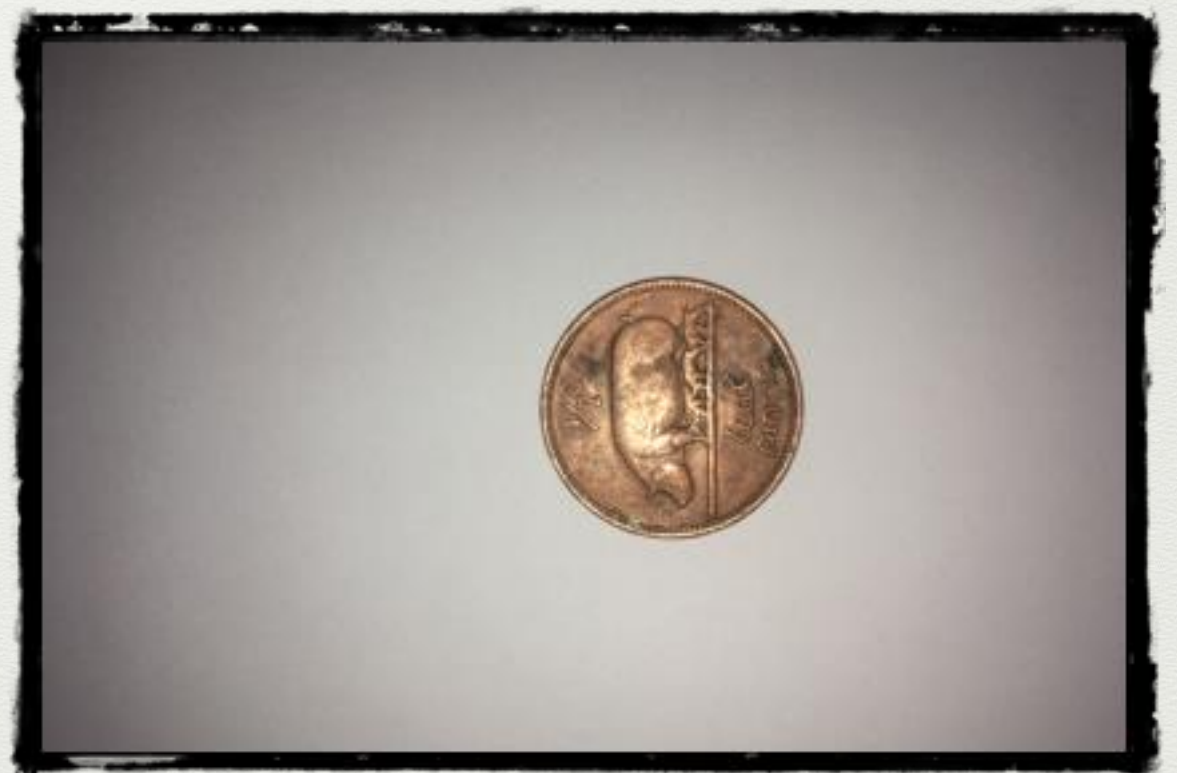
Old Half-Penny Coin.