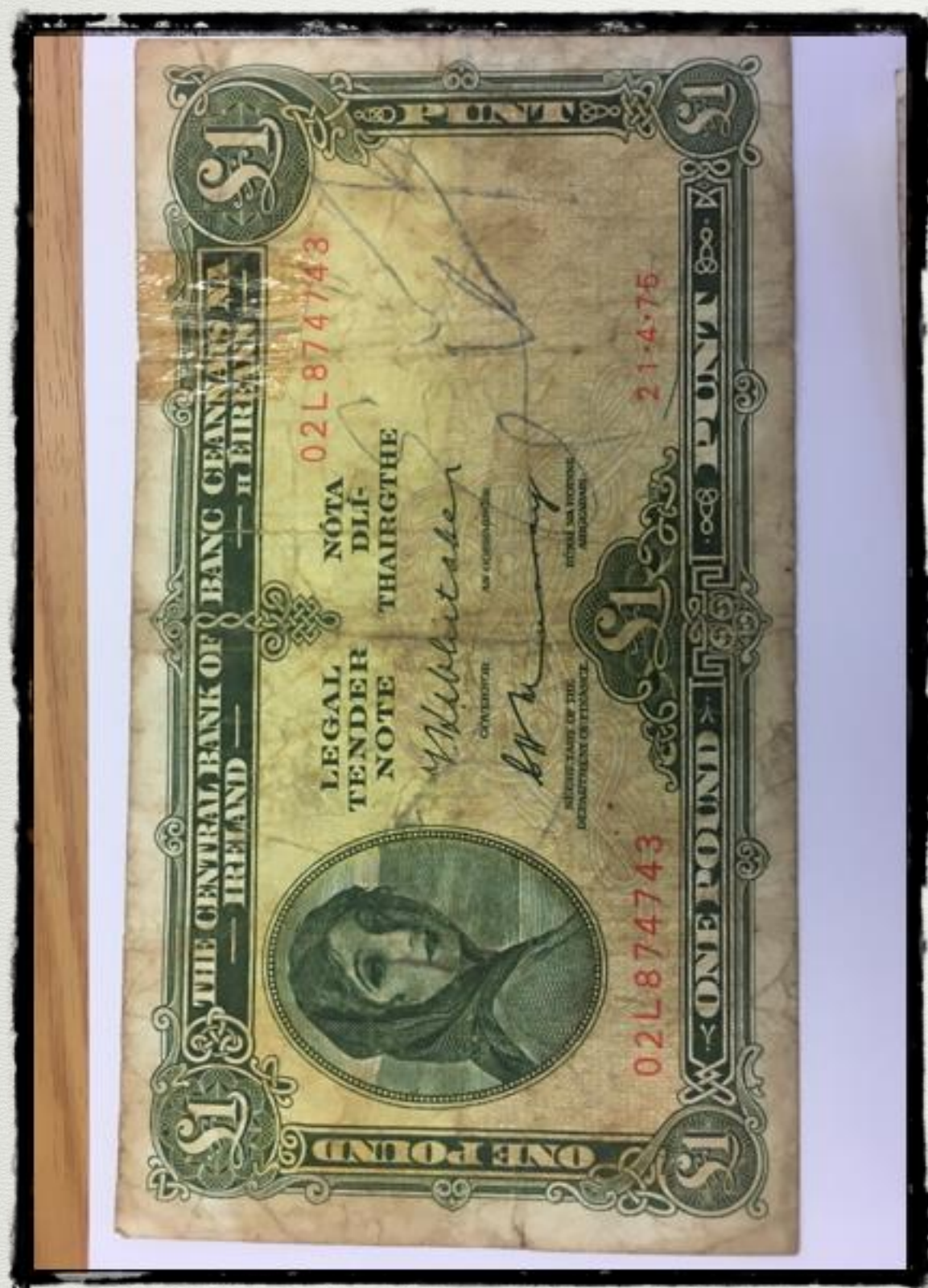
Old 1 Pound Note.