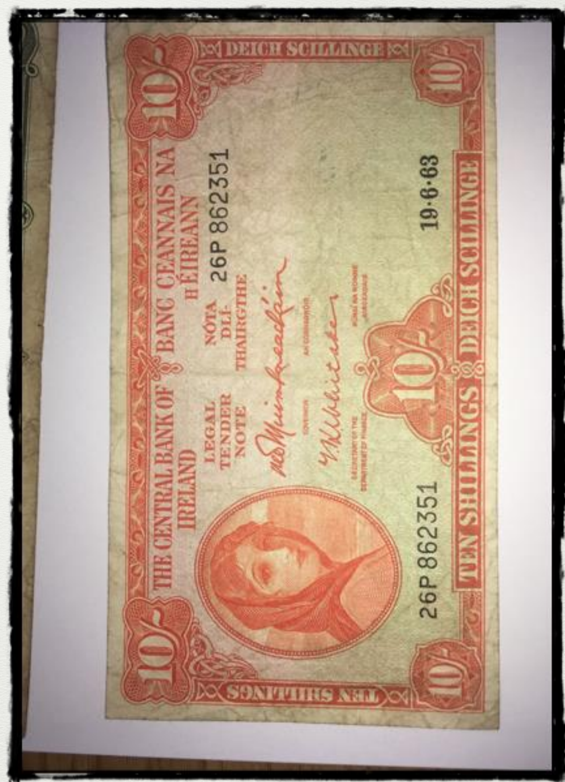
Old 10 Shillings Note.