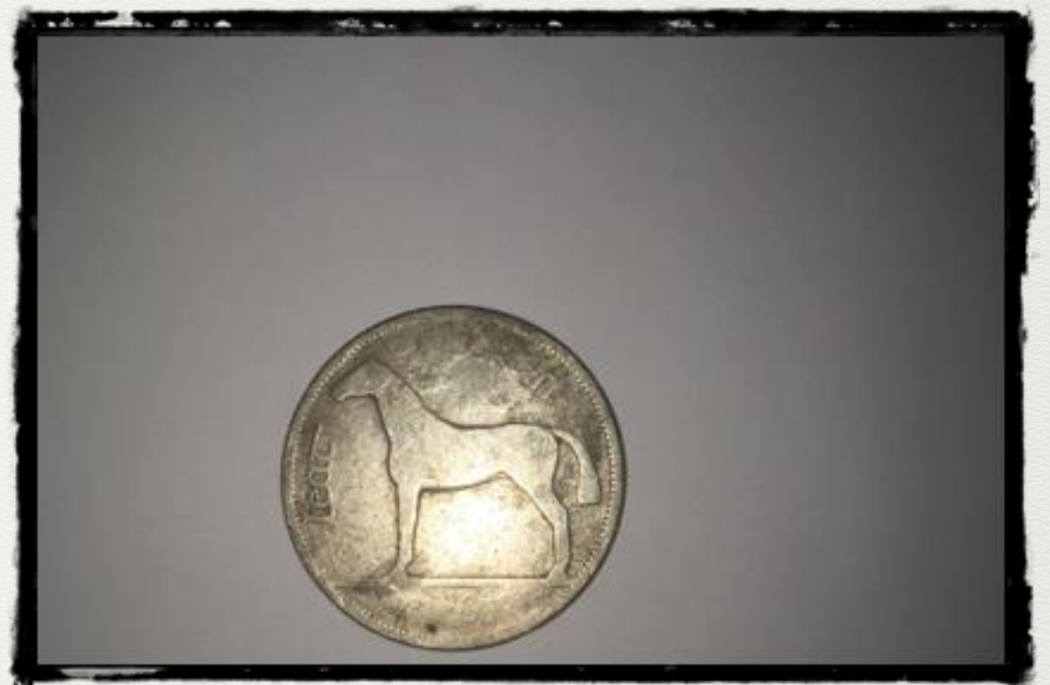
Old Half-Crown Coin.