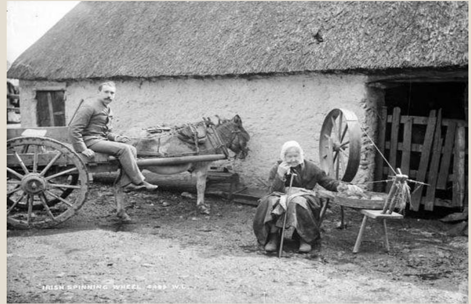
IRISH SPINNING WHEEL - 1885 W.C.